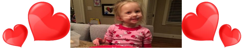
Raising Awareness for Riley

You will be informed as to which day your child will be photographed.